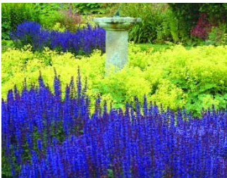
Chesters Walled Garden